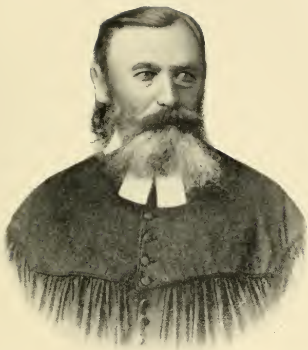
Miloslav Jozef Hurban,