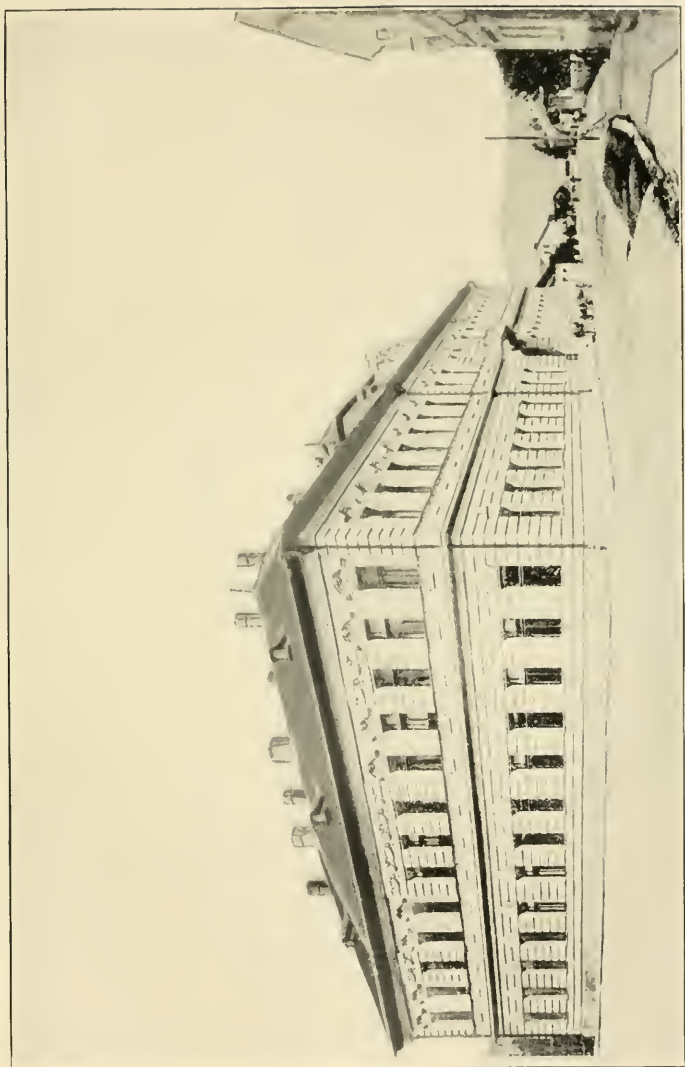
THE MATICA BUILDING CONFISCATED BY THE GOVERNMENT