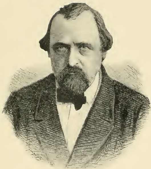
Michal Milošlav Hodža