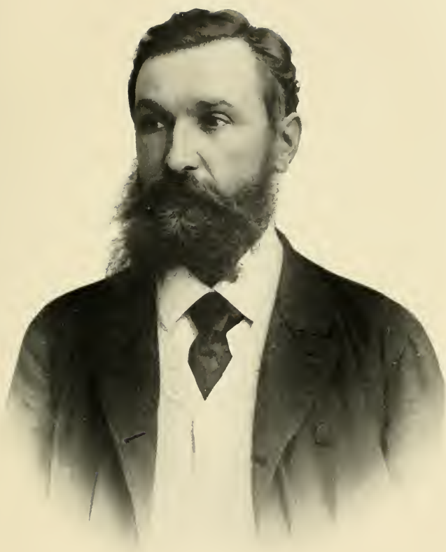
Iverson's 'Hurban Vapourbay'